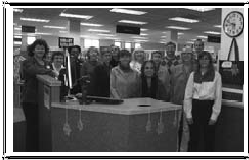
Library staff gather around the new front desk.

At last, a new front desk at the SLO Library! Thank you Friends for your $50,000 donation to its construction. We had our self check area up and running in April but a few construction delays held back installing our new desk, which we all think is beautiful and a wonderful replacement for the 'orange dinosaur'. We can better see all our customers and also move in and out with ease. We have discovered that the new blue carpet under the desk takes a bit of vacuuming but we are happy to do it. Our customers love it and find it very modern and classy. Next up, our public art project. ArtsObispo recently lost their lease and are moving into the Ludwig Center, with no display space so we are in discussion with them to display some of their artwork here in the library. They are also interested in our public art project so hopefully we'll have good news soon about our being able to move forward with that. The city already promised us $35,000 matching funds and we are busy trying to raise our half. We think a building dedicated to celebrating the local arts will bring in more and more visitors who will then more likely support our efforts overall in the county. Beautiful buildings bring in more customers and thus more support. It's a win-win all around.