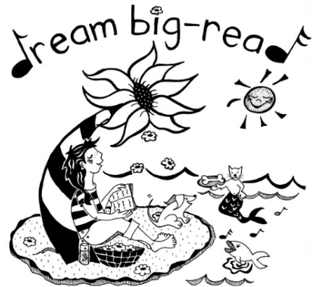
Rebecca Brockway "Dreams Big."

The adults are also jumping in with a reading theme this winter called Hot Reads for Cold Nights. Read 9 books and receive prizes and surprises! You can sign up at the SLO Library Reference desk. The program runs through April 1. You can see all our events at our home page at www.slolibrary.org . We also are on Facebook at www.facebook.com/slocountylibrary .